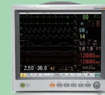
elite V8 Modular Patient Monitor